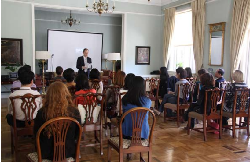
A full house at our Climate Week Pecha Kucha!

How YOU can make a difference to the FCO's environmental footprint the easy way.